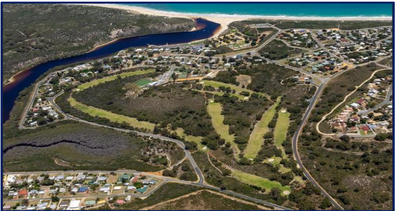
Guilderton Golf Course 2021